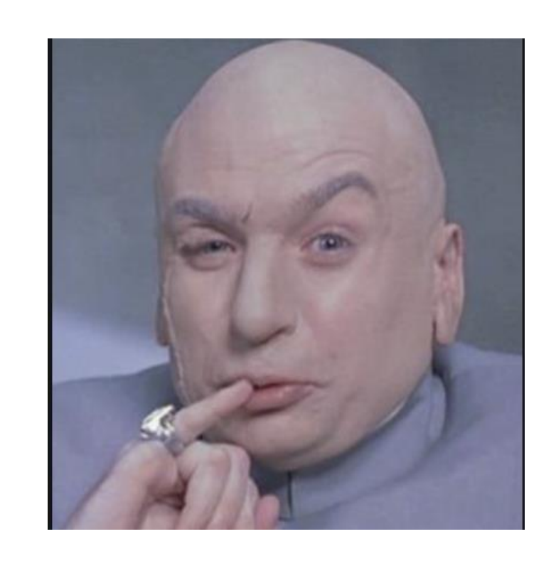
Screenshot from a DVD copy of Austin Powers: International Man of Mystery' created and uploaded by <u>Blackwatch21</u> to Wikipedia. Image copyright for the film is owned by the New Line Cinema and presented here as fair use under US copyright law.