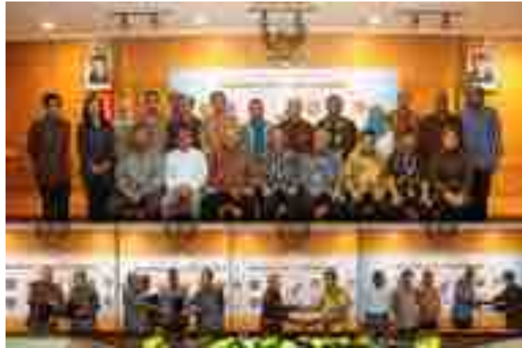
MoU between LAPAN and local government