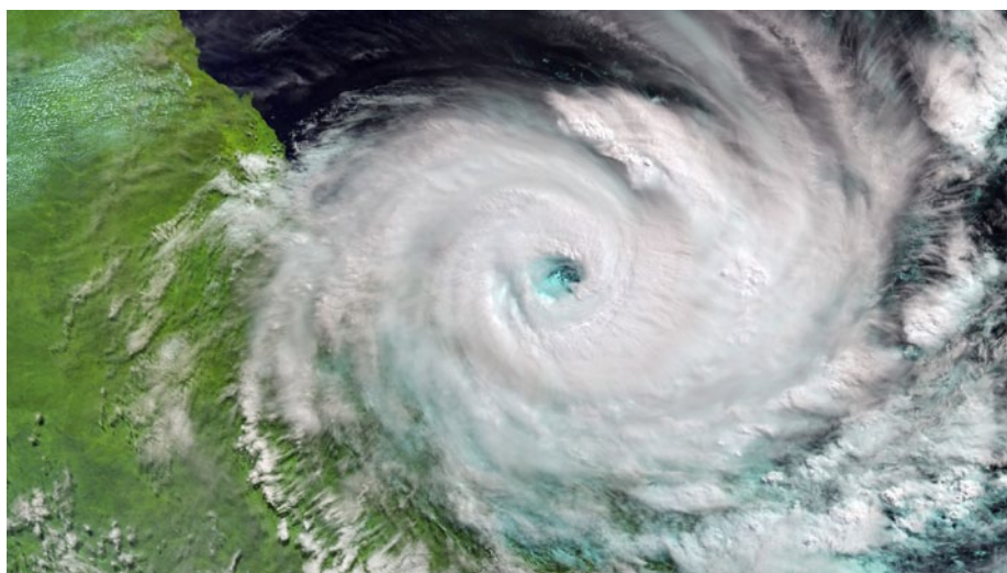
Cyclone Debbie captured by Copernicus Sentinel-3A satellite's Ocean and Land Colour Instrument as it struck eastern Australia on 27 March.

Since then, UNOOSA, through its Platform for Space-based Information for Disaster Management and Emergency Response (UN-SPIDER), has been engaged with the community that promotes science and technology for Disaster Risk Reduction (DRR). UNOOSA participated in and contributed to a number of events