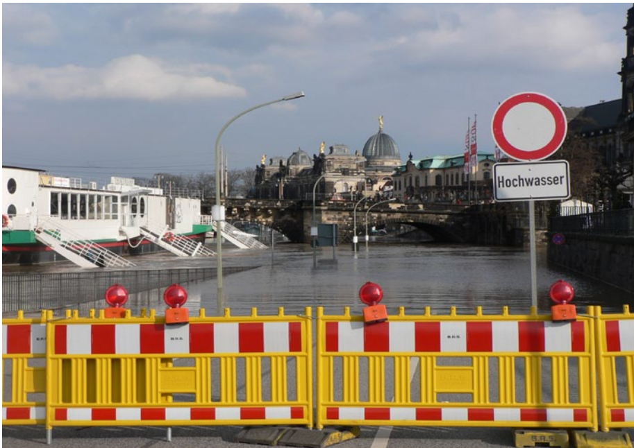
Flood in Dresden, Germany, in 2006

In recent decades, government agencies have implemented early warning systems as a way to reduce the impacts of natural hazards of different types. Implemented along with other disaster risk reduction measures, these systems help reduce the number of people killed or injured by natural hazards, as well as losses and damages.