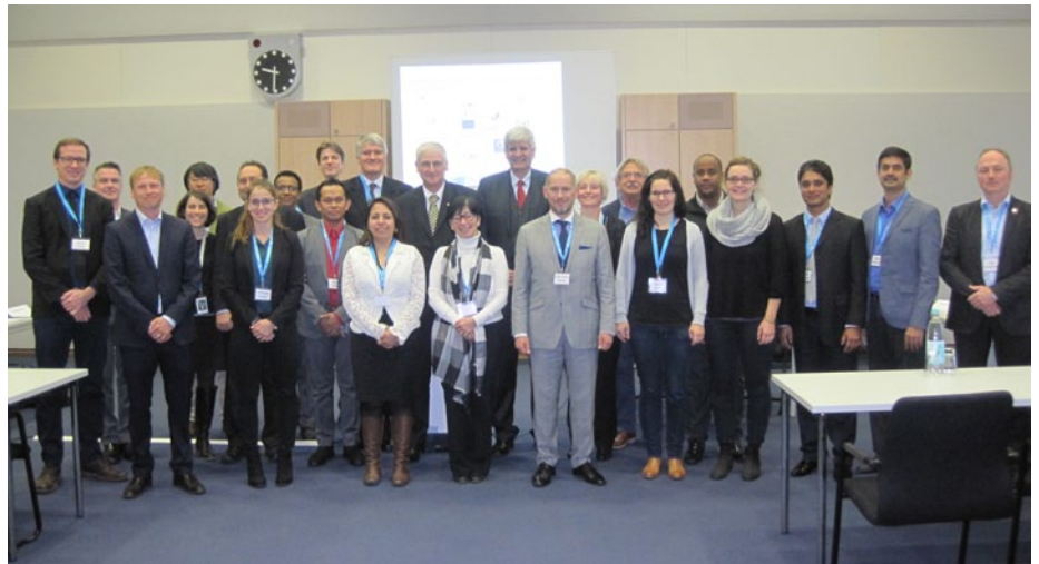
Participants at the International Expert Meeting on the Global Partnership Using Space-based Technology Applications for Disaster Risk Reduction (GP-STAR), 1-2 December 2016

The Global Partnership using Space-based Technology Applications for Disaster Risk Reduction (GP-STAR) was launched during the 2015 Sendai Conference. It represents a platform for innovative space technology to be effectively translated into strategies for disaster risk reduction at a local, national and global level. The voluntary multi-stakeholder partnership has since been actively leading efforts in incorporating the use of Space-based Technologies and Applications and